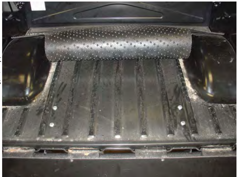
“Figure 2” Upper Side