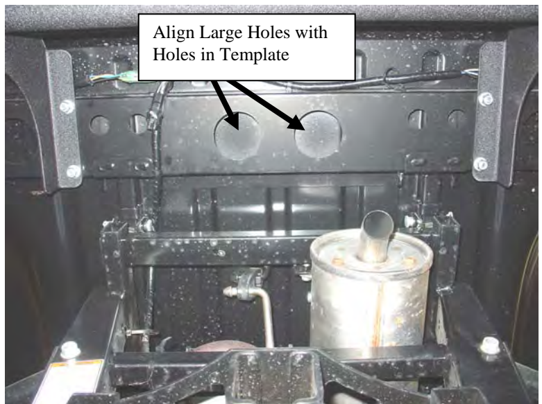
“Figure 1” Under Side