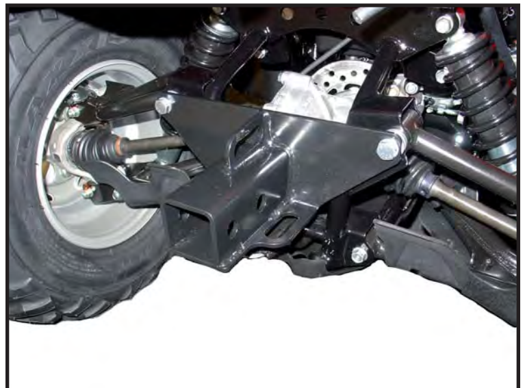
"Figure 3" Receiver Installed