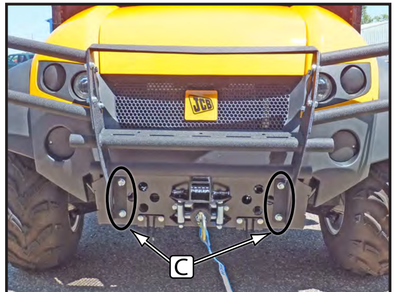
"Figure 3" Brush Guard Install