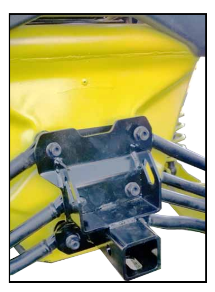
"Figure 3" Receiver Install