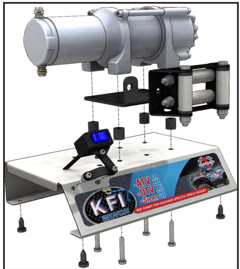
“Figure 2” Winch Install