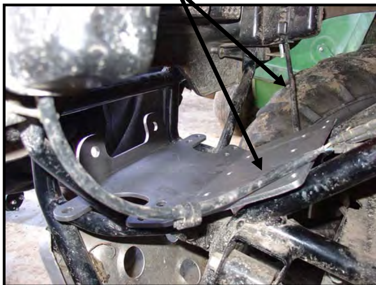
"Figure 1" Mount plate shown in position without Winch for location reference.