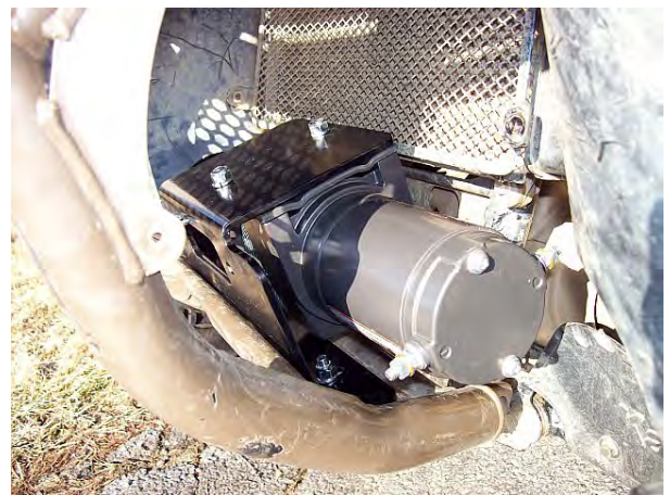
"Figure 2" Mount Shown in Position with winch