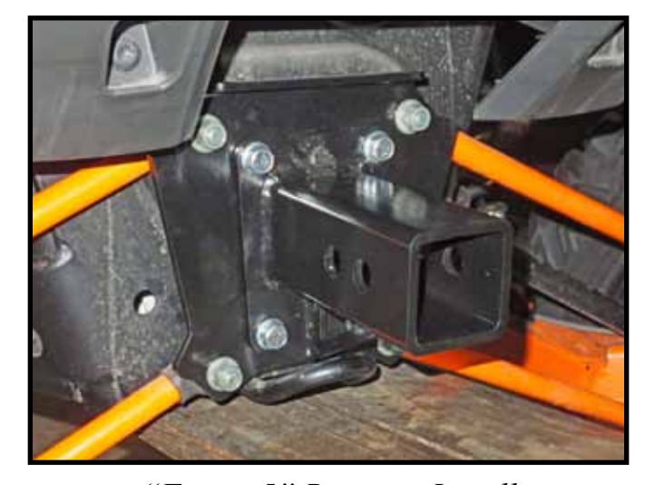
"Figure 5" Receiver Install