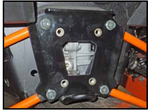
"Figure 4" Plate Install