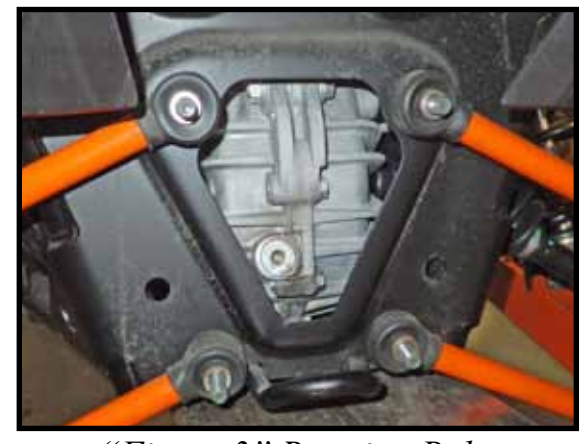
"Figure 3" Rotating Bolts